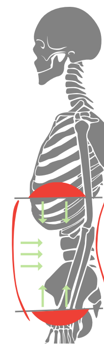
CANISTER POSITION RIBCAGE AND PELVIS STACKED

The next important region when we think of balance is our abdomen, the center of our mass. Believe it or not, our abdomen actually functions like a pressure canister. We want equal pressure distributed between the diaphragm (top), the abdominal muscles (front), and the pelvic floor muscles (bottom). As you can see in the adjacent picture, this equal pressure causes our ribcage to stack directly over our pelvis which is the optimal position for ANY movement, exercise, or even standing! It centers us directly over our foot tripod, setting us up to be stable when exposed to uneven forces.